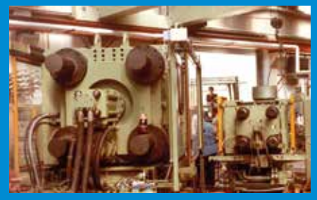
1961 PE / PP PROCESSING