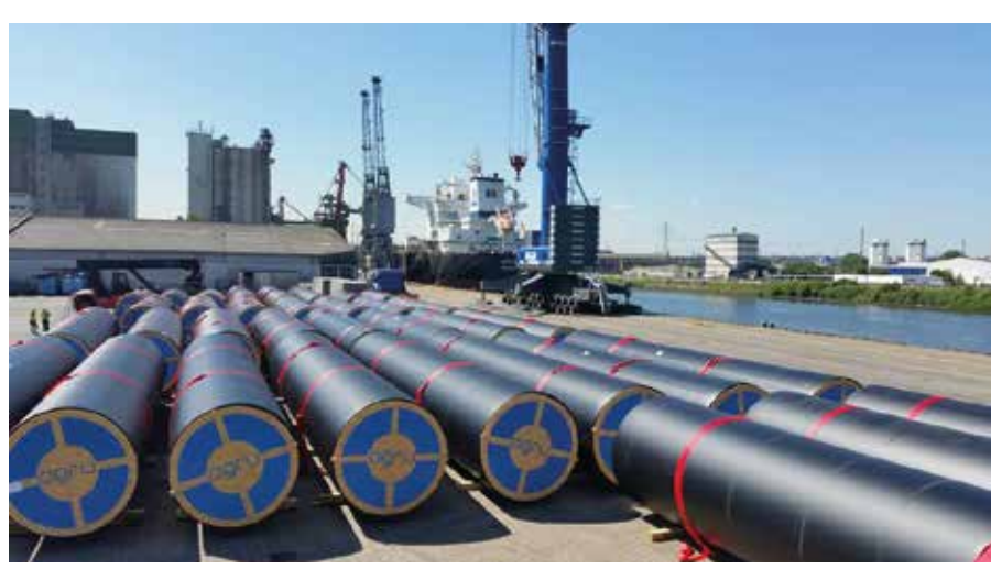
GLOBAL LOGISTIC OPERATION