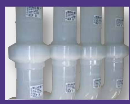
PURAD PIPING SYSTEM