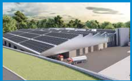
2023 COMPLETION OF PLANT 6