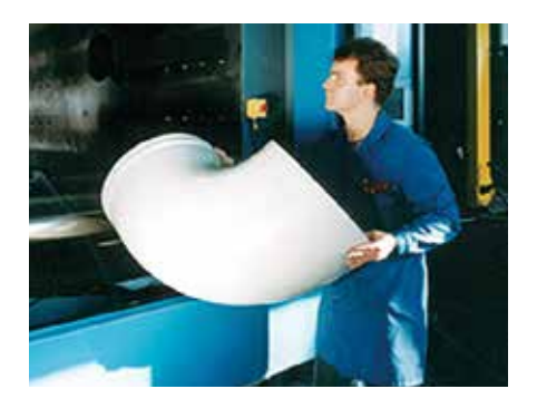
1966: INJECTION MOULDING

NUMEROUS WORLDWIDE PATENTS AND CONTINUOUS NEW AP-PLICATIONS UNDERLINE THE INNOVATIVE STRENGTH OF THE AGRU GROUP AND ITS GLOBAL ACTIVITIES