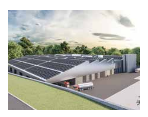
2023: PLANT 6 NEWLY BUILT