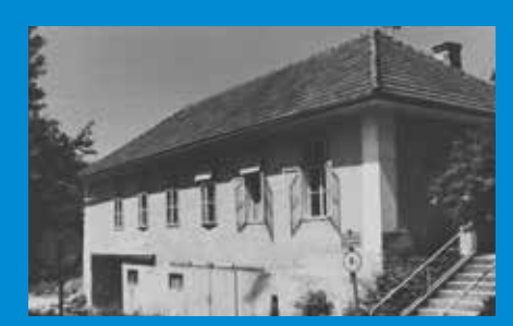
1948 FOUNDATION OF AGRU