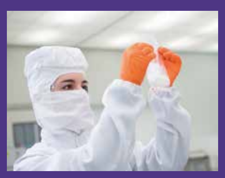
CLEANROOM CLASS 5