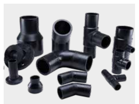
2016: WORLD FIRST IN PE 100-RC